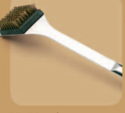
My Mate's Scrubber

BeefMates Wide Spatula Product Code: 94976