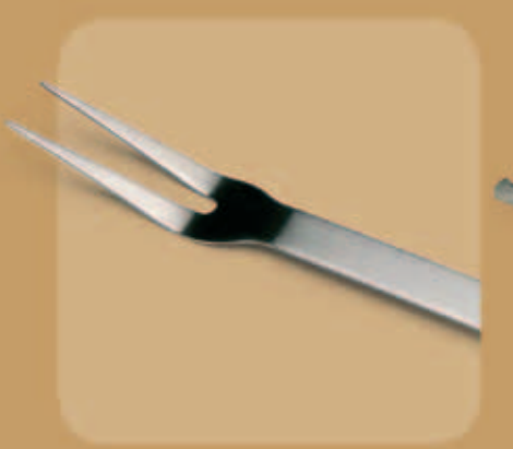
Have a Stab Mate