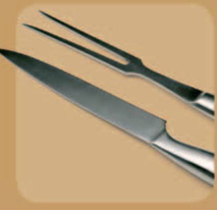
Carve it up Mate

BeefMates Brush & Scraper Product Code: 94973