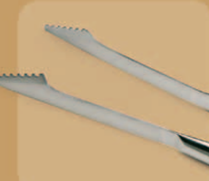
Get a Grip Mate