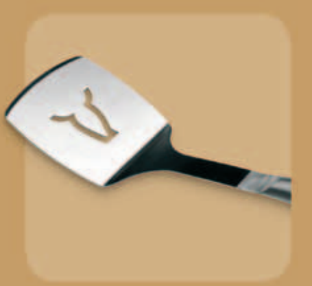
Give'em the Flick Mate

BeefMates 17" Spatula Product Code: 94971