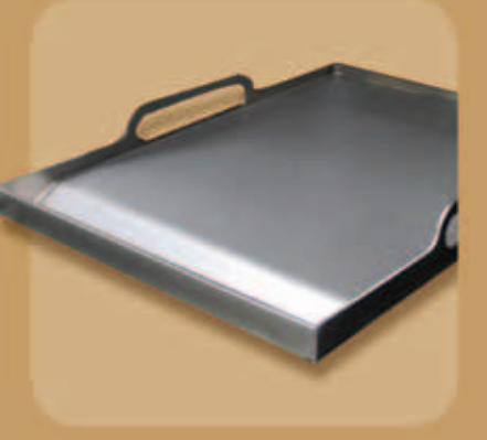
Try some Teppanyaki Mate

BeefMates Pizza Oven Product Code: 29710