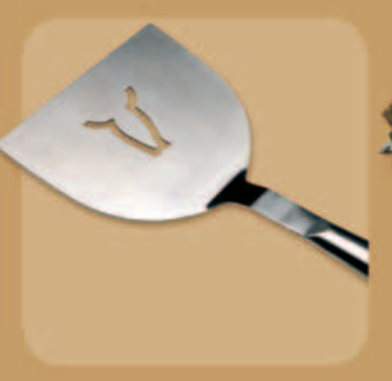
Give'em the Flick Mate

BeefMates 17" Spatula Product Code: 94971