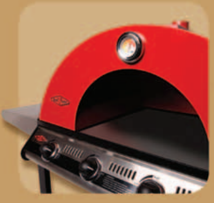
Pizza Perfection Mate

BeefMates 6 Piece Steak Knife Set Product Code: 94966