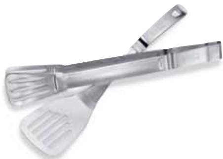
Stainless Steel Tools

Dishwasher proof tongs and spatula are for use with the Q™.