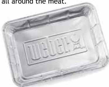
Replacement Drip Trays

Keep your Weber® Q™ clean and dust free with a fitted heavy-duty cover.