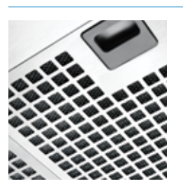
FRESH AIR FOR CLEAN COOKING The Westinghouse Rangehood is designed for easy maintenance with stainless steel covered filters<sup>^</sup> to make cleaning easier. ^ WRG980CGS & WRG970CS

QUIET OPERATION Superior air flow without the noise. Designed to operate at low noise levels even on the high fan setting. Maximum noise level of 56dB(A)<sup>+</sup> when on high fan setting. <sup>+</sup> WRG970CS, WRF900CS & WRF600CS